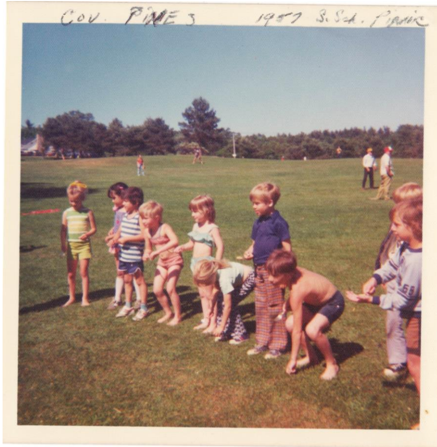
(Church picnic at Coventry Pines Golf Course 1957)

You are invited – Free Lunch! Sunday September 10 th at 12 Noon